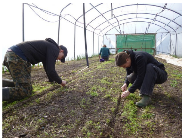
Work morning micro-weeding