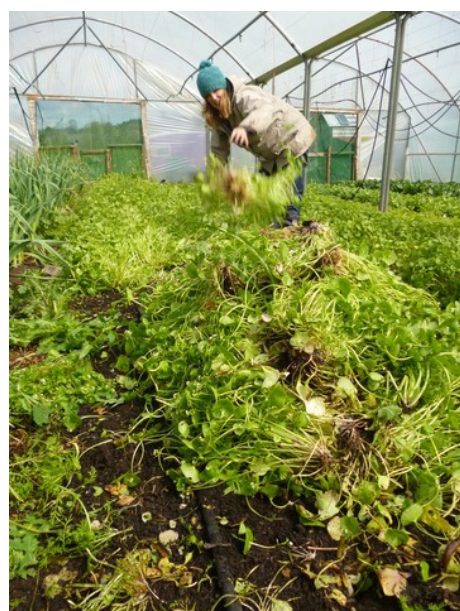
Out with the old, ready for in with the new - clearing out the purslane