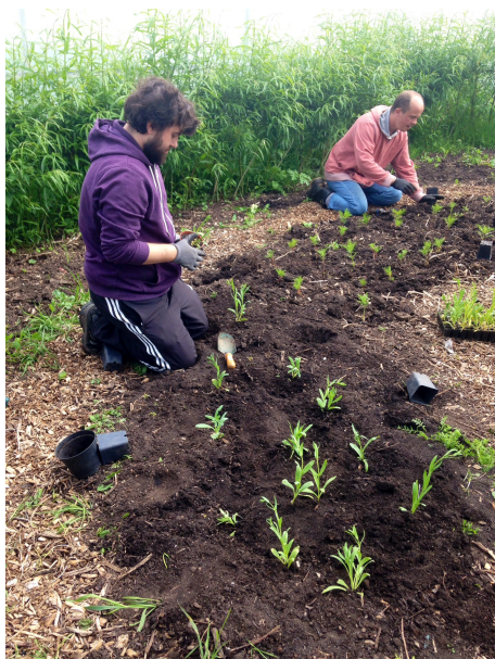
Wednesday group weeding in the Willows garden