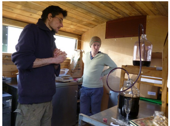
Racking a batch of wine

members how to start a batch of wine and then demonstrate the necessary skills to arrive at the end