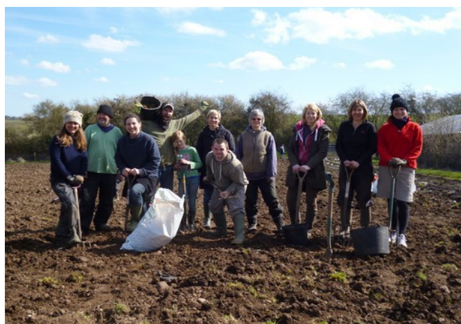
Big spring work morning - couch grass removal team

Hello to all Canalsiders! You might have read my introduction in the last newsletter, and I have tried to meet as many members as possible on collection days, so hopefully mine is not now such an unfamiliar face to many of you. I have now been working on the land alongside Will and the team for two months,