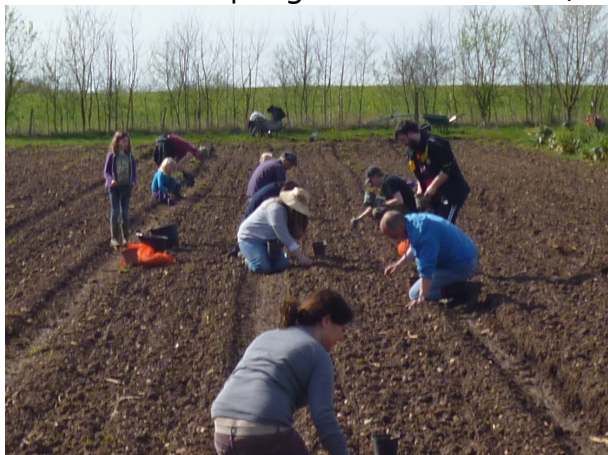
Onion planting - in the sunshine at the precise moment of this photo!

The late winter / early spring period has been defined by two factors: cold weather in February and March, and plenty of rain in March and April, which have left us slightly behind schedule, as we had very few opportunities to cultivate the land ready for the first plantings (as those who attended the spring social will know!).