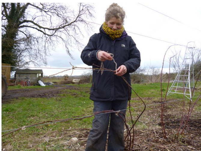
Tying in the blackberries