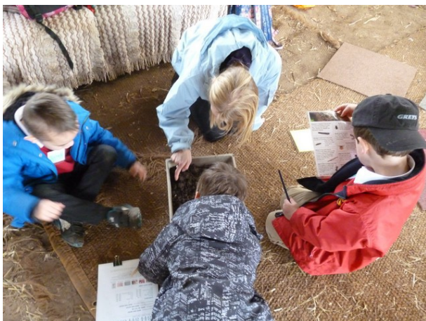
Using a pictorial key to identify animals in compost

polytunnels. Bursary help may also be available to go towards the cost of transport if the visit wouldn't otherwise be possible. If you'd like to suggest this to your child's class teacher, please take a flier from the hooks by the pinboard in the collection space to pass on to the teacher.