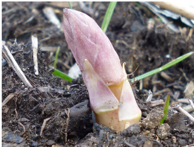
A 'pre-rabbit' asparagus shoot

leporine friends on Canalside veg (understandably, if I may say so myself) that they have been conducting nightly raids on the emerging asparagus shoots! Fortunately the fence repairs and a timely application of protective mesh have put a stop to this, and we should hopefully see the asparagus strengthening this season to allow for the first harvest in 2017.