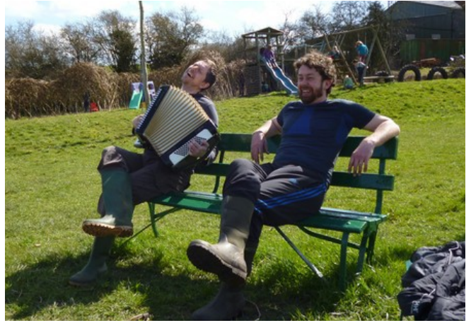
Post-work relaxation at the big spring social

So it should have been a day to make progress on the onion planting, but the endless rain in March meant that it wasn't possible to prepare