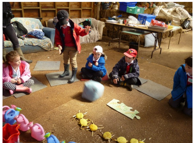
A cooperative game to learn about plants' needs and crop pests

We can still accommodate other visits this summer and until the end of October. Visits are free to school groups (any age), provided they last at least 2 hours and include a tour of the fields and