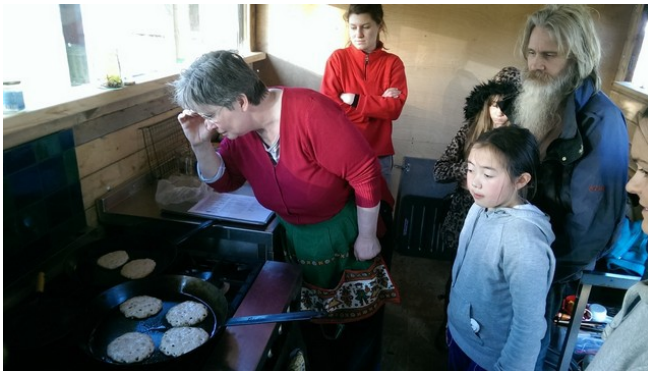
Checking on the crumpets