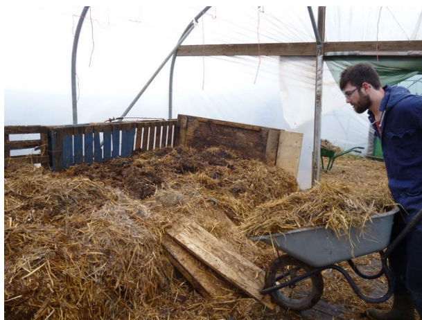
Making a manure hot bed

Another interesting development this season has been the progression of the hotbed system,