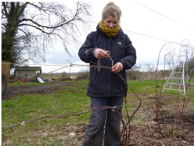
Tying in the blackberries