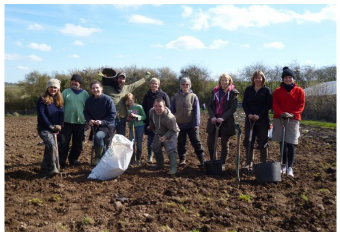
Big spring work morning - couch grass removal team

The late winter / early spring period has been defined by two factors: cold weather in February and March, and plenty of rain in March and April, which have left us slightly behind schedule, as we had very few opportunities to cultivate the land ready for the first plantings (as those who attended the spring social will know!).