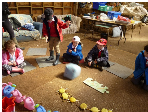
A cooperative game to learn about plants' needs and crop pests

We can still accommodate other visits this summer and until the end of October. Visits are free to school groups (any age), provided they last at least 2 hours and include a tour of the fields and