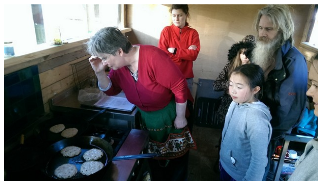
Checking on the crumpets

had a productive morning removing couch grass from the new garden plot – a task that will definitely pay off later in the year. We were joined by more people at lunchtime for soup and sunshine, with the usual range of delicious contributions that were added to the lunch table. After lunch, member Erica Moody showed a group of wannabe sourdough bakers how to use a sourdough starter for bread, crumpets and pancakes.