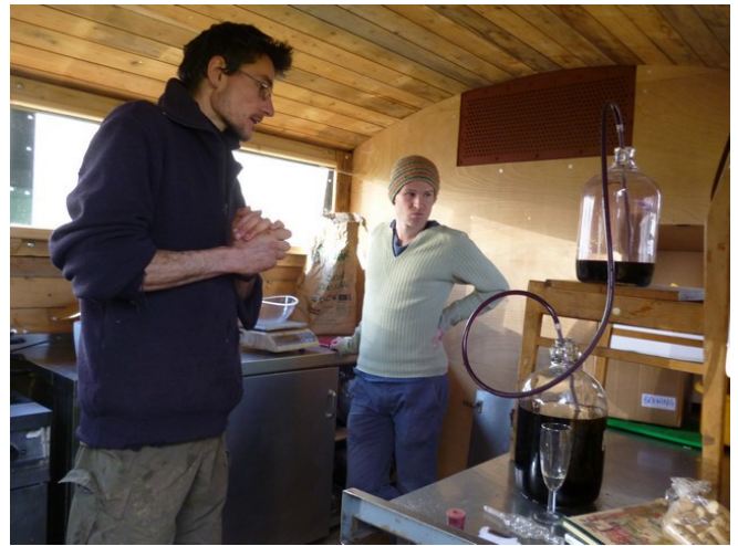
Racking a batch of wine

blueberry wine (from Scottish blueberries) went down especially well!