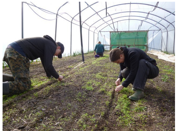
Work morning micro-weeding