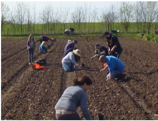
Onion planting - in the sunshine at the precise moment of this photo!

However, we managed to get the first wave of field plantings (February-sown broad beans, beetroot, chard, spring onions, lettuce, kohlrabi and calabrese broccoli, and direct-drilled rocket) completed by the third week of April, so we are getting back on track. The workshare parties have also shown exceptional talents in planting onions, even in the hail, which has helped to compensate for the missed opportunity at the social.