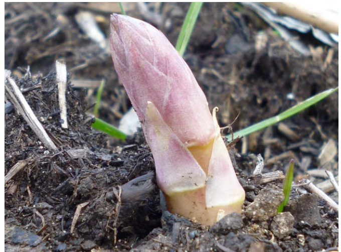
A 'pre-rabbit' asparagus shoot