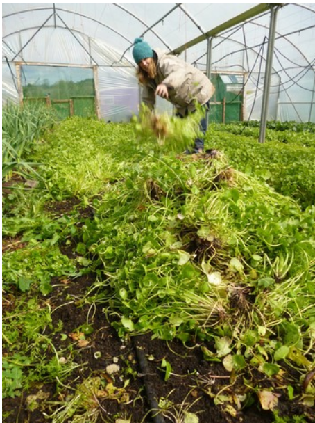
Out with the old, ready for in with the new - clearing out the purslane