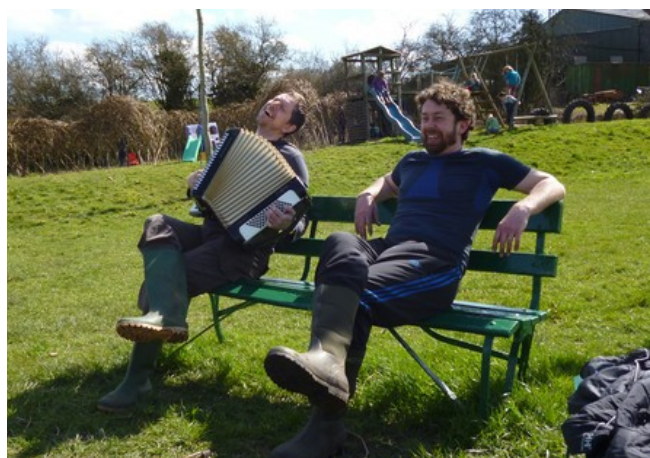
Post-work relaxation at the big spring social

So it should have been a day to make progress on the onion planting, but the endless rain in March meant that it wasn't possible to prepare the onion beds. Instead, the team of workers