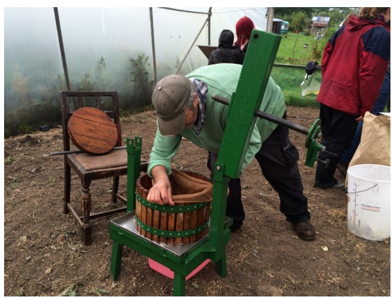
Setting up the press