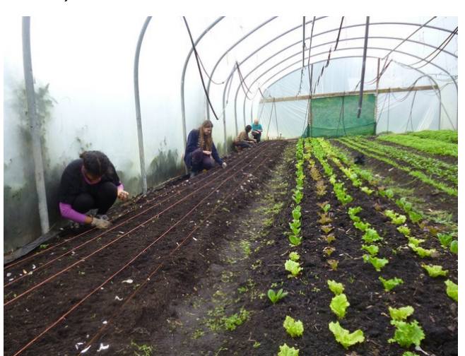
Planting up overwintering salad crops

Speaking of salad, another challenge we have faced recently is a shortfall in lettuce production – caused partly by slug attacks on one late batch of lettuce, and an oversight in sowing another batch back in the summer. We have therefore been trying to keep a salad portion going in the share every week with higher proportions of rocket and oriental brassica leaves (tatsoi, mustard, mizuna), chicory-type salads (radicchio) and even "weeds"! I refer to chickweed ( Stellaria media ), a prolific weed in most cultivated soils across the UK, which fortunately happens to be