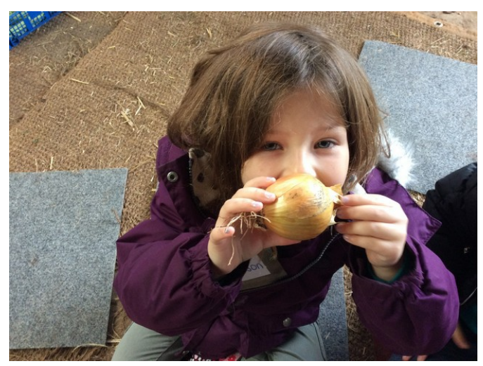
A sensory exploration of vegetables!

fields. The children enjoyed seeing the tractor working in the fields and having a go at harvesting different types of vegetables when we found them.