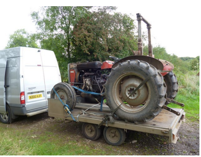
Our poorly tractor, on its way to visit the Tractor Doctor

As field-scale veg growers, we are very much reliant on our tractor. Although by conventional UK agricultural standards we operate on a very small scale and use a relatively high proportion of hand labour, a helping hand from Mr Diesel is nonetheless essential in cultivating 10 acres of field crops. So, it was the grower's worst nightmare when the reverse shifter fork in our tractor's gearbox snapped back in September. After an intensive crash-course in navigating Warwickshire's affordable tractor mechanic community, two and a half weeks of waiting, and settling a four-figure bill, our beloved Massey