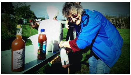
^ Enjoying fresh juice < Chop, chop!