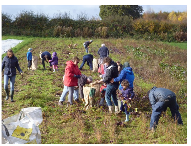
Bringing in the beets

A fine autumn day heralded the big beetroot harvest (a welcome contrast to some years where the volunteers have braved mud along with the wet and cold to help out). 500kg of purple beetroot 'Janice' were added to the sand clamp