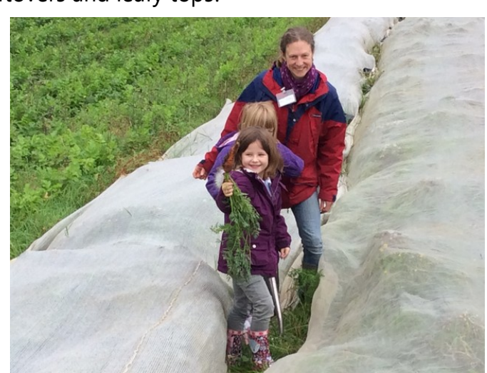
We found a carrot!

If you are interested in helping with future visits, and enriching the experience for the children, in